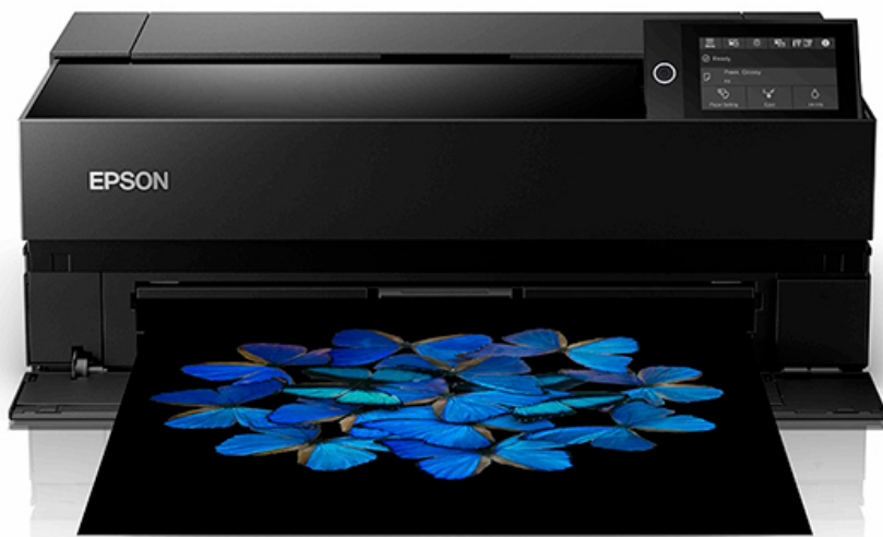
Front view of the new Epson P906 printer.

Epson has released details of its new A3+ SureColor P706 and A2+ SureColor P906 desktop photo printers, which will be available in Australia from July.