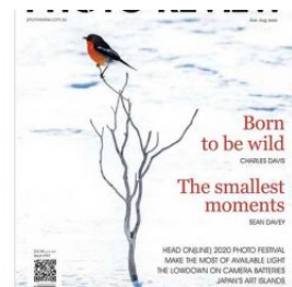
Photo Review Jun-Aug 2020 Issue 84 – The intimate wildlife images of Charles Davis; Sean Davey’s small moments project; Head On Photo Festival 2020; Japan Art Islands; How to make the most of available light; The quest for long-lasting prints, and more...