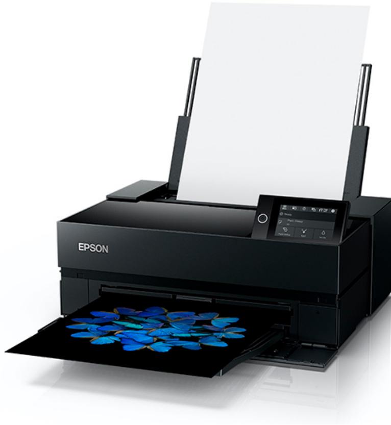
The new Epson P706 printer.

An updated mobile version of Epson Print Layout software provides full support and colour management tools for iPhone and iPad printing, enabling direct printing from iOS devices for the first time. The SureColor P706 can accommodate both roll and cut sheet media, while the SureColor P906 is for cut sheet media only. An optional fully enclosed roll media adapter is available to support both 2-inch and 3-inch rolls and roll printing up to -18m long.