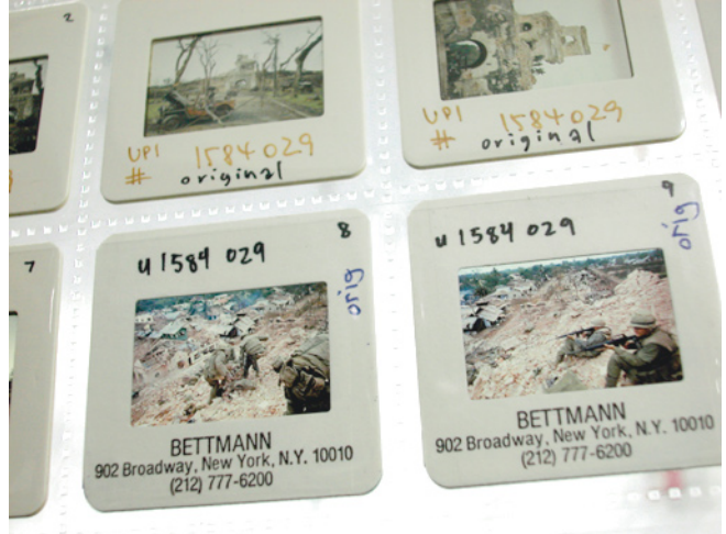
These Kodak Ektachrome-X color slide films were actually in Sawada's cameras in the jungles of Vietnam when the photographs were made on February 15, 1968 while covering the battle at the Citadel in Hue, Vietnam during the Tet Offensive. A primary goal of the Corbis sub-zero preservation effort is to permanently preserve important historical artifacts such as these Ektachrome transparencies in their original, unchanged form.