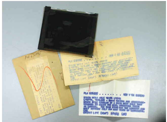
The Corbis-Bettmann collection of 13 million original and duplicate negatives, prints, glass plates, and color transparencies is also a museum of the era of traditional photography which will, essentially, be at an end by 2010. Sub-zero storage preserves everything, including blue “Ditto” spirit duplicator caption slips, card catalogs, magazines, newspapers, and books.