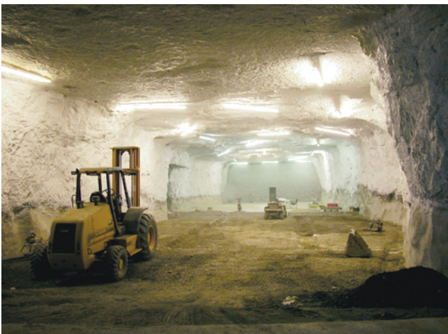
Housed in a former limestone mine that at one time served the Pittsburgh steel industry, new areas in the mine are being cleared for construction of additional records preservation centers.