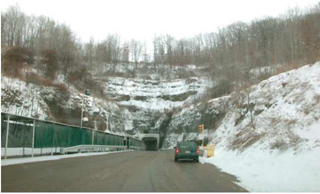
The guarded entrance to the Iron Mountain/National Underground Storage Vital Records facility, located in a secluded area about an hour's drive northeast of Pittsburgh, Pennsylvania.