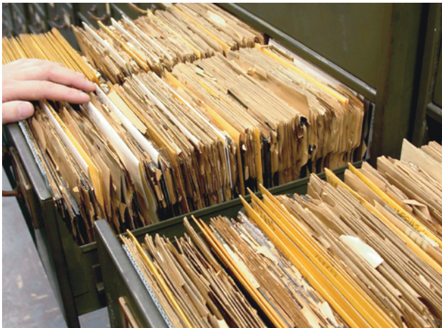
A critical part of every historical collection is the identifying information found on deteriorating negative envelopes, caption sheets, rubber stamp impressions, and pressure sensitive stickers on the backs of prints. Sub-zero storage preserves not only the photographic originals, but also the “metadata” that supplies the essential information about “when, where, and who?”

ceptable changes in the images, sub-zero cold storage is essential. One of the goals of the Corbis-Bettmann sub-zero preservation effort is to serve as a model to other institutions as to how to best preserve the photographic era of the past 150 years in a permanent, secure, accessible, and cost-effective manner. 14-18 Fortunately, with a complete digital infrastructure already in place, Corbis is now seamlessly moving forward into the age of digital cameras, scanners, digital image catalogs, and worldwide digital image distribution!