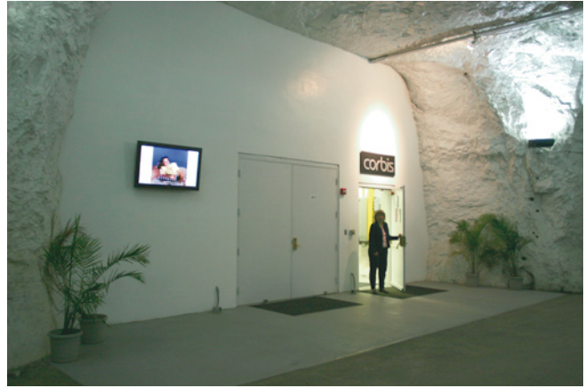
With an LCD video display showing photographs from the Corbis collection, the entrance to the Corbis Film Preservation Facility has a somewhat otherworldly appearance when one first encounters it deep within the underground limestone mine.