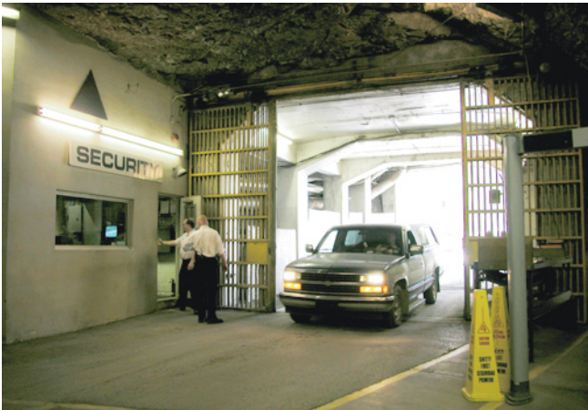
The home to a large number of paper-based, film-based, and digital records centers serving the U.S. government, business, and Hollywood motion picture industry, armed guards and electronic surveillance systems provide security 24 hours a day.