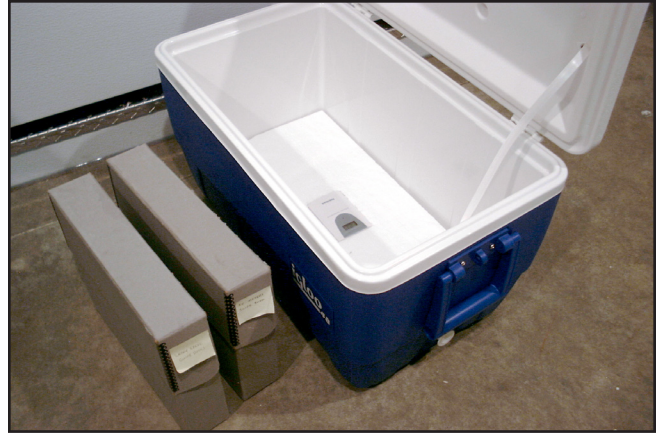
Figure 4. A transfer box for acclimatization made from an inexpensive picnic cooler. Two layers of Styrofoam (2 inch total thickness) were added to the bottom (picnic coolers typically do not have insulation on the bottom). The top layer is fitted with a wireless thermocouple (available at Radio Shack, Inc. for under $60.00). The acclimatization is complete when the thermocouple reads within a few degrees of the surrounding environment.

The WIR vault was deliberately designed without a staging room. Our approach to bringing materials in and out of the vault was also to once again use cost-effective passive climate control methods. Dehumidified cold vaults have traditionally made use of an antechamber or “staging” room that operates at an intermediate temperature halfway between the cold zone and the ambient room temperature in the user environment. This staging room is also dehumidified to low RH levels. The use of a temporary vapor barrier such as a recloseable polyethylene bag has also been recommended as a practical method for item transfer, the theory being that condensation is kept to the outside surface of the bag. We had never questioned either methodology until we conducted some staging experiments that brought to light a potential problem with both approaches. The intermediate temperature/low RH approach may prevent condensation for