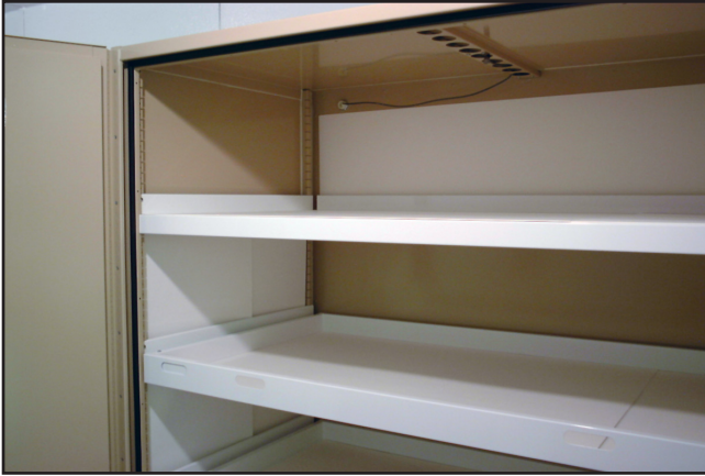
Figure 3. 4-ply mat board was inserted on the side and rear walls of the cabinets. It was also used to line shelves. Some shelves have a lip underneath that allows a carefully fitted piece of mat board to be suspended on the underside of the shelf. This location is preferable because the surface does not get covered as collection materials are added, although the addition of collection materials usually enhance rather than hinder the moisture buffering performance of the cabinet.

air than would occur if only simple Brownian motion of the air molecules was involved.